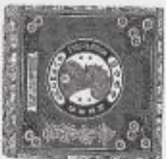
KINCHO wasabi oshi (the wasabi for enjoyment) will

bring happiness and the sense of "homeland" to all Japanese companies in Serbia. It has a rich perfume flavor and the beautiful appearance.