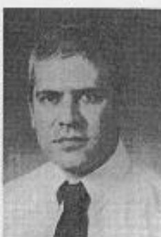
President of the Republic of Serbia Boris Tadic

Serbia would like Japan to play an even more important role in the international arena and to contribute even more to resolving international issues. That is yet another reason prompting Serbia