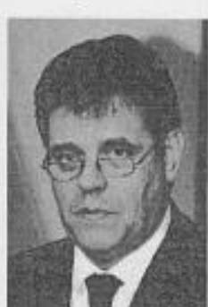
Prime Minister of the Republic of Serbia Vojislav Kostunica

We are very proud and pleased that the Japan Agency for International Cooperation opened an office in Belgrade last autumn as its regional office for the Western Balkans. Renowned Japanese