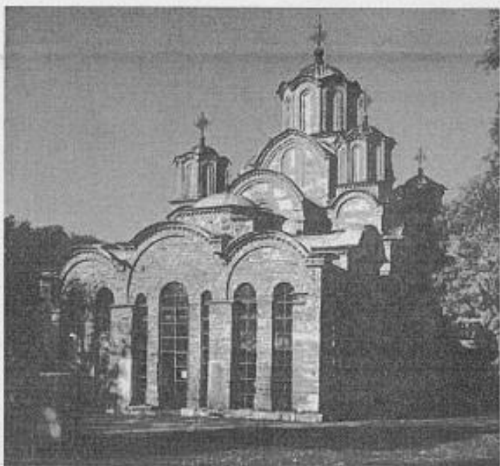
GRACANICA MONASTERY from Kosovo and Metohija, Serbia

4-15, 1-Chome, Takasandaba, Shinjuku-ku, Tokyo 160-0075, Japan Tel: +81-3-2267-4321 (Rep./Fax), +81-3-2265-5794 / http://www.jaccnet.co.jp